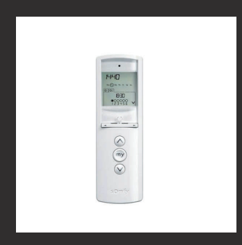
Telis Chronis 6 Timer