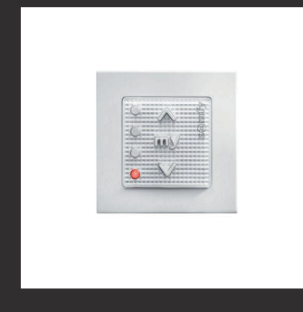
Smoove Origin 4 RTS + Frame (White)