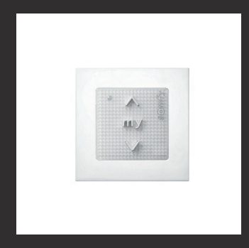
Smoove Origin 1 RTS + Frame (White)