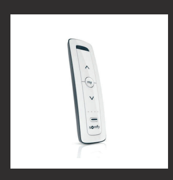
5 Channel Remote