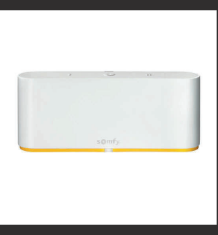
Tahoma Switch Hub