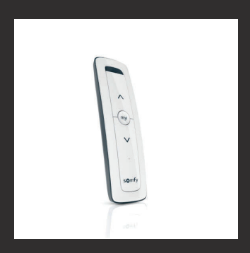
Single Channel Remote